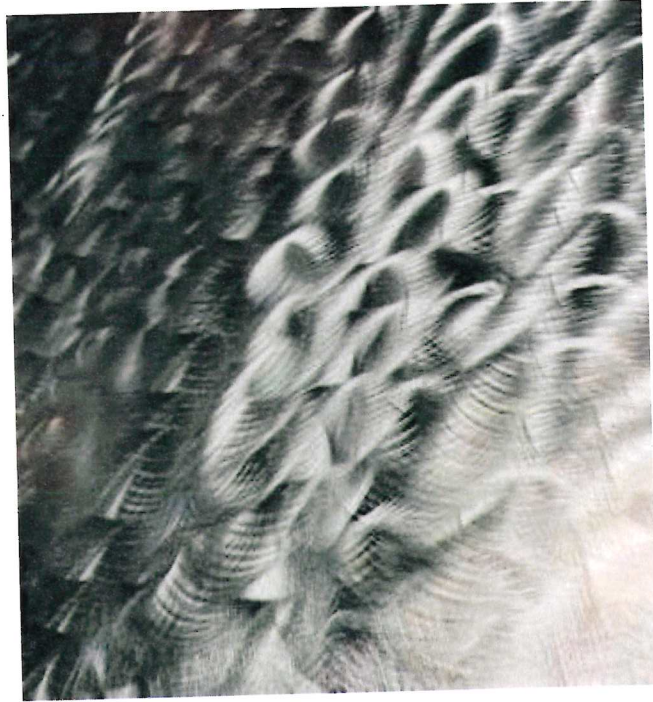
Engine Turn Swirl Example