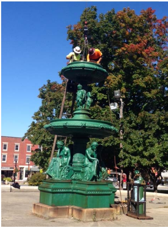
Workers from Robinson Iron dismantle the fountain